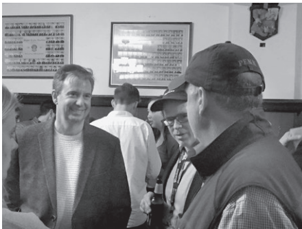
SAE alumni enjoying the post-game reception at the Chapter House after Penn's Homecoming win over Princeton.

There have been a lot of alumni reunion events recently. Weren't able to attend? Here's what our brothers have been up to: