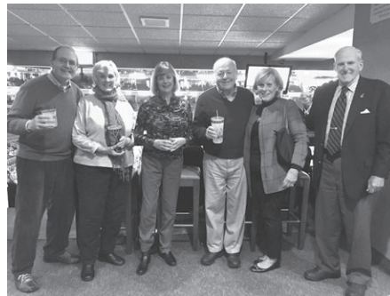
SAE alumni and spouses enjoying the Sixers game at the Wells Fargo Center after Penn's Homecoming win over Princeton.