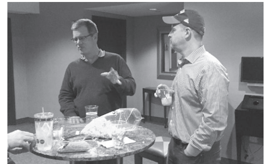
SAE alumni enjoying the Sixers game at the Wells Fargo Center after Penn's Homecoming win over Princeton.