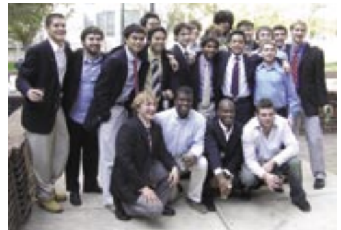
The actives went out of their way to give us a warm welcome.

I am still fielding requests from groups of alumni who are interested in sponsoring future post-game Homecoming receptions, specifically underwriting the food and drink. Remember, we're dealing with college students, so if we want to eat real food, we must take an active role in the preparation (and funding).